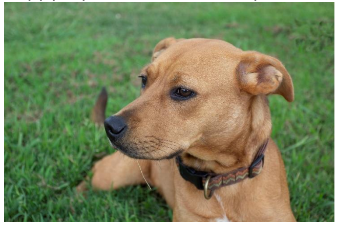
One of the available animals eligible for waived fees

The City of LaGrange Animal Services is proud to be a partner of the Puppy Pipeline since its inception in 2007.