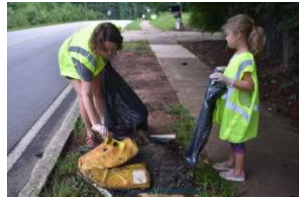
The City of LaGrange plans to hold monthly clean-up events

Landa with Keep Troup Beautiful. For more information go to <u>www.keeptroupbeautiful.com</u> or call (706) 884-9922.