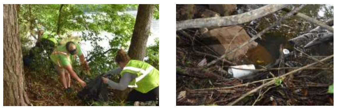
Trash from the side of the road washes into the lake

In April, City Manager Meg Kelsey wanted to send a message to the community that the City of LaGrange is serious about cleaning up litter and rolled out the city's campaign, "Leaving LaGrange Better Than We Found It."