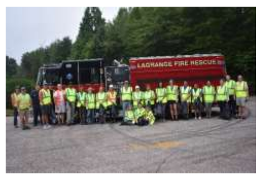
Nearly thirty City of LaGrange employees and residents participated in the July litter pick-up event

The group started picking up trash at Hollis Hand Elementary on Country Club Road and continued along West Point Lake.